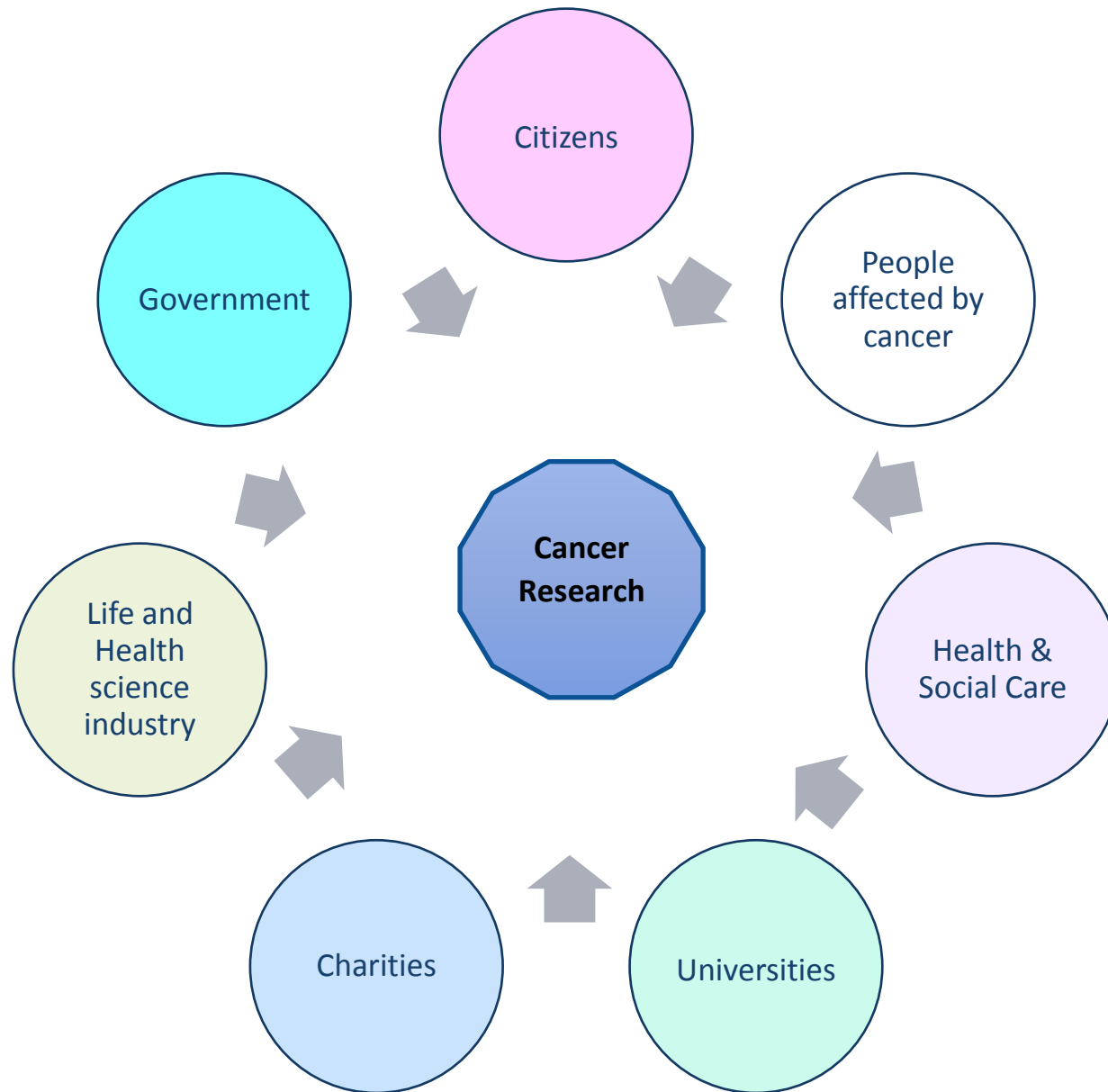
Figure 1: People with an interest in cancer research