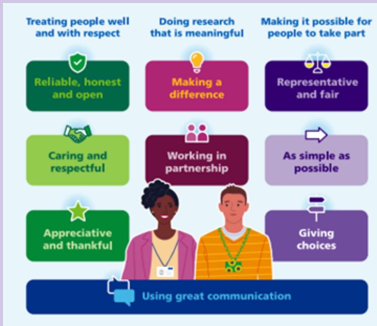
Figure 2: Hallmarks of Good People-Centred Clinical Research . Health Research Authority. May 2024

EDI, Personal and Public Involvement (PPI) and people-centred clinical research go hand-in-hand.