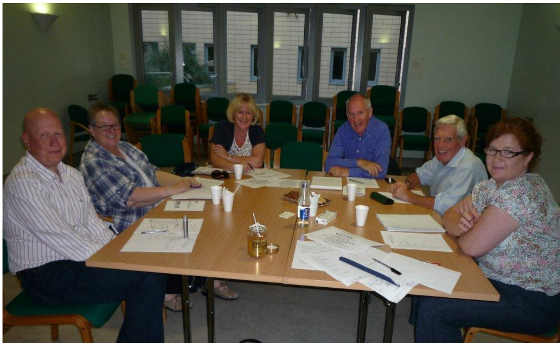
Planning Meeting July 2012

The most ambitious project of the Forum has been planning a PPI Masterclass and Public Information Evening in September 2012, hosted by the Forum. The event will showcase the activity of NICTC/NICTN. We look forward to this opportunity to tell the public more about how they can get involved, and to hear from researchers, leading speakers in PPI, and cancer patient perspectives.