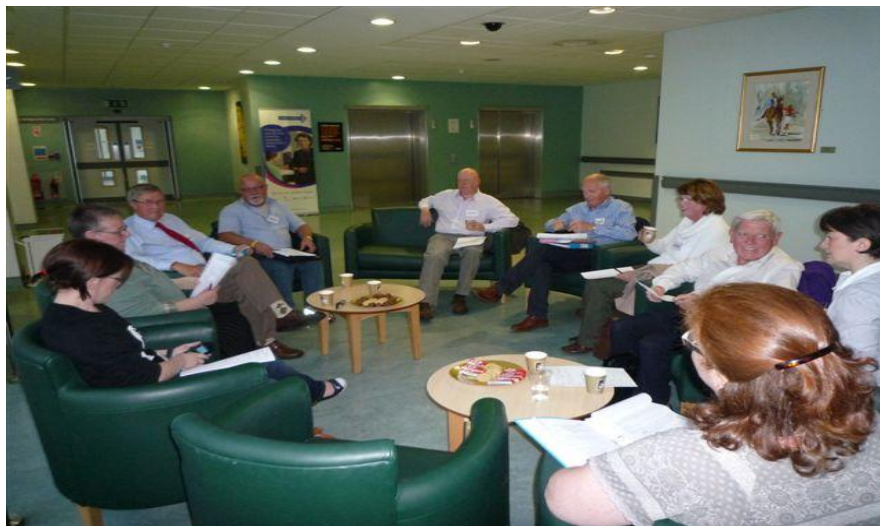
Forum Meeting June 2012

Quarterly meetings took place at the Cancer Centre at Belfast City Hospital, covering various aspects of Forum business.