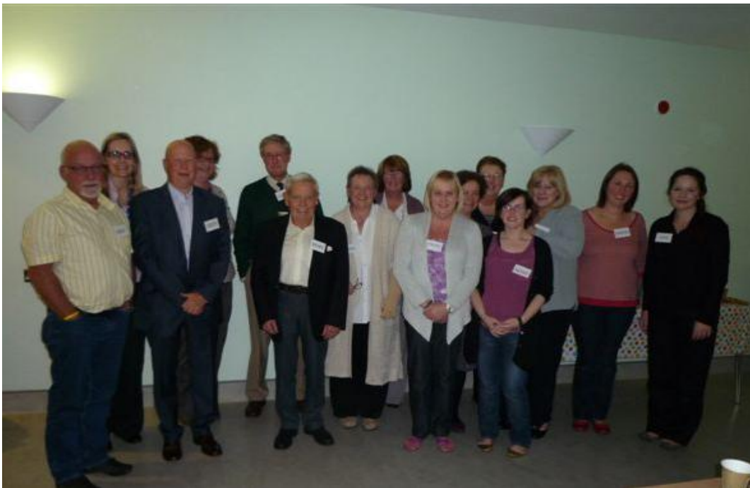
Forum Meeting September 2011

Throughout the year, membership has fluctuated between 15-17 members. This number of members has brought a diversity and wealth of experience and skills which enhances the Forum and the contribution of PPI to cancer research in NI. The Forum remains open to new members who also want to help shape cancer research.