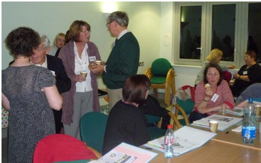
Forum Meeting September 2011

The Northern Ireland Cancer Research Consumer Forum (NICRCF) brings together people affected by cancer to influence cancer research and contribute a consumer perspective to research being conducted in Northern Ireland. The work of the Forum also includes networking and planning. The Forum provides a visible focus of Personal and Public Involvement (PPI) in cancer research in Northern Ireland.