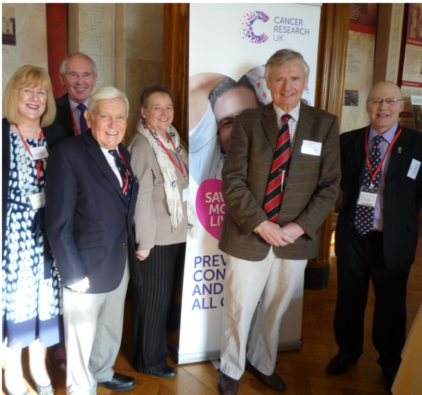
Forum members at Stormont in February 2014

In February 2014 members of the Forum attended a Cancer Research UK presentation about Early Diagnosis to the NI Assembly Health Committee in Stormont.