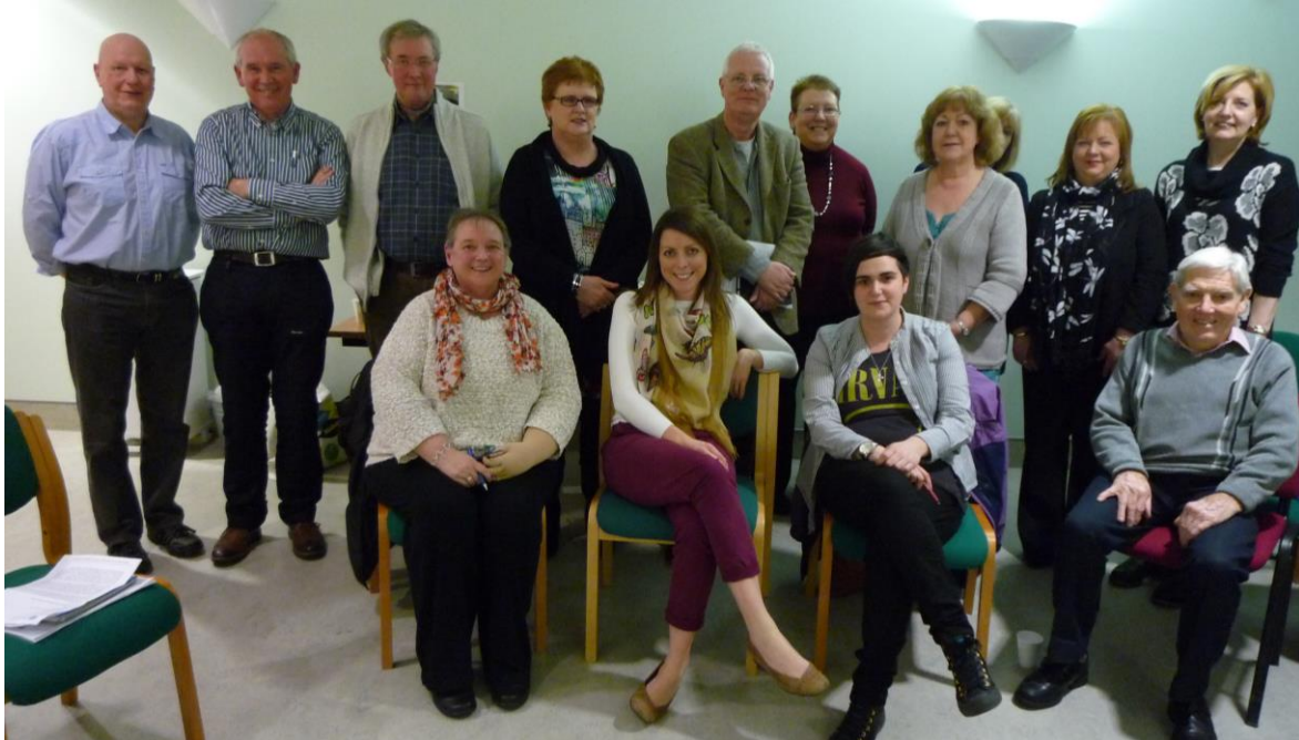
Forum members and researchers from the School of Nursing, QUB, meet to discuss PPI in cancer and palliative care nursing research

Following this, the Forum generated research ideas and discussed their areas of priority at their next meeting, and forwarded these for review by the relevant researchers in the School and plans for working together are on-going.