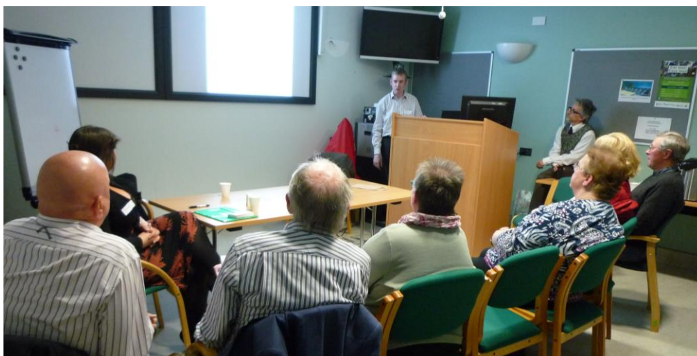
Forum members hear from the NI Cancer Registry about a grant proposal

partnerships with PPI representatives, which will not only benefit the research proposal, but also enhance any future research process.